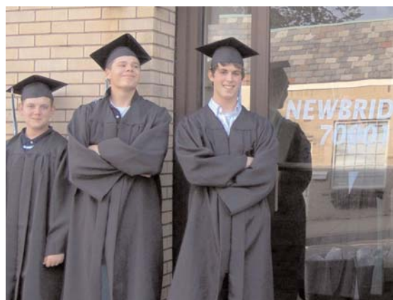
Graduates from NewBridge 70001 JOBS PLUS Class of 2006 celebrate their success.

This free program for high school dropouts ages 16 to 21 in Morris, Sussex and Warren counties provides them with an alternative education option, including job and GED preparation, personal and career counseling, and transportation in Morris County.