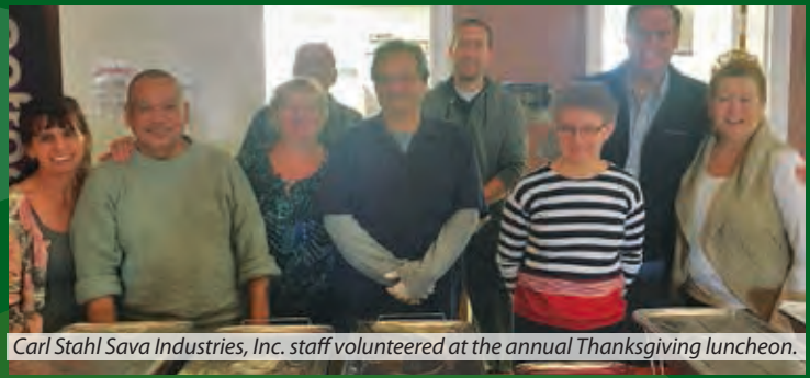
Carl Stahl Sava Industries, Inc. staff volunteered at the annual Thanksgiving luncheon.